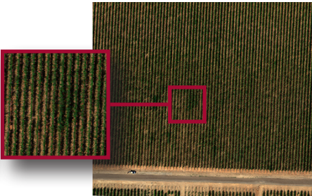
Vineyard - 120m. Areas of increased growth as seen in High-Res RGB layer.