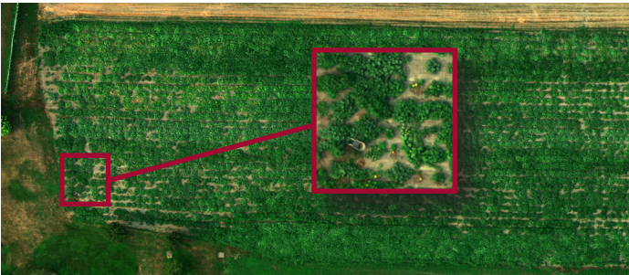
Pumpkin Patch - 60m. Standard-sized wheelbarrow and pumpkin detail shown in closeup.